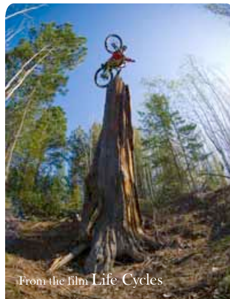
From the film Life Cycles