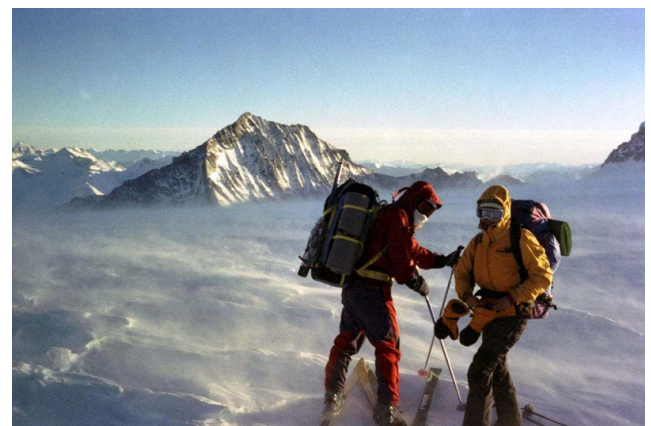
High winds on the Glacier de la Vanoise, France.