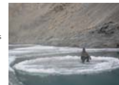
Martin Cook - 'Humour in the Mountains'