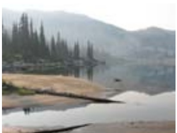
Iwona Erskine-Kellie - 'Scenery'