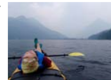
Bryce Leigh - 'People'