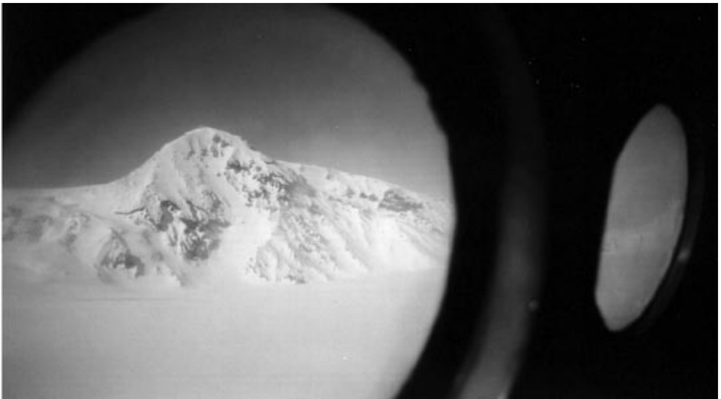
Flying into the Kamchatka Penninsula.