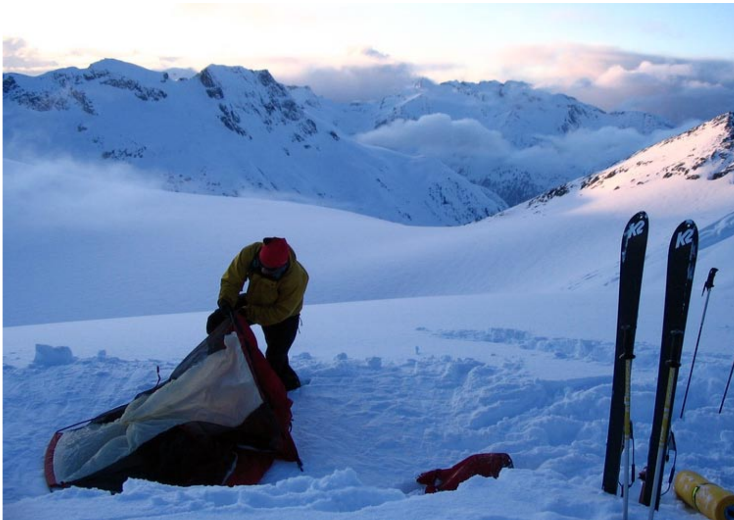
Setting up camp 4 deep in the McBride Range.

Alpine Club of Canada - Vancouver Section News