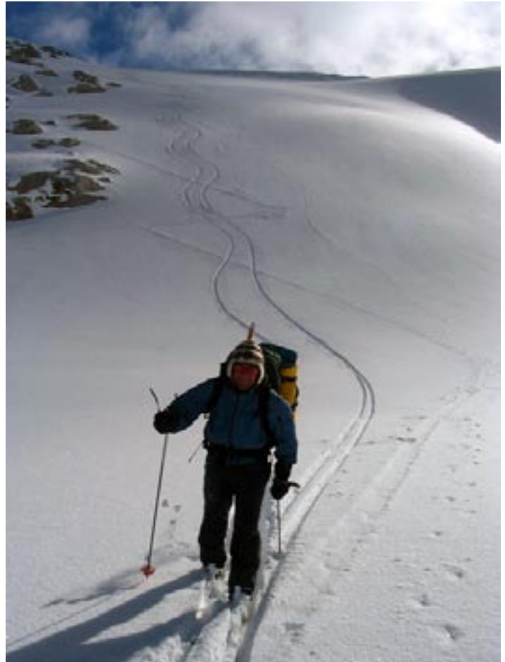
Champagne anyone?

Finally, the ACC is currently staffing a new full time "Director, Club Services" position located in its National Office in Canmore, Alberta. The closing date for applications is February 5, 2006. For more information, see www.AlpineClubofCanada.ca/clubservicesdirector